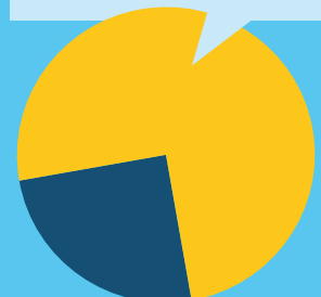
ABC Member Questionnaire

1.6 million new skilled workers will be needed between now and 2022.